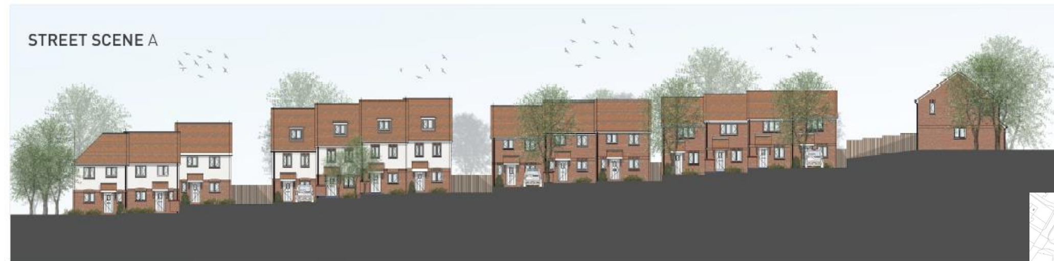
STREET SCENE A