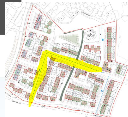
STREET SCENE D