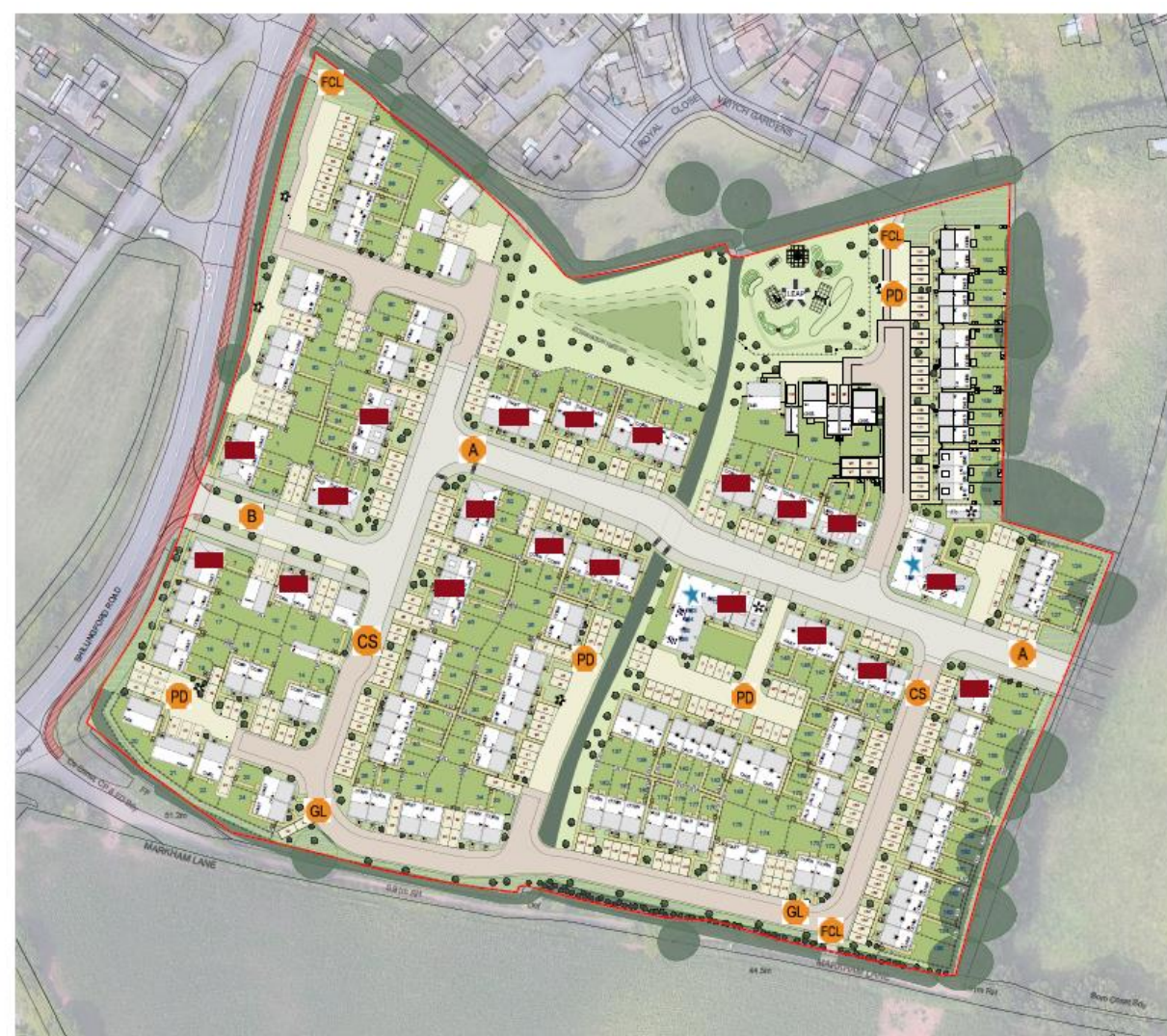
FRAMEWORK PLAN AND PROPOSED LAYOUT